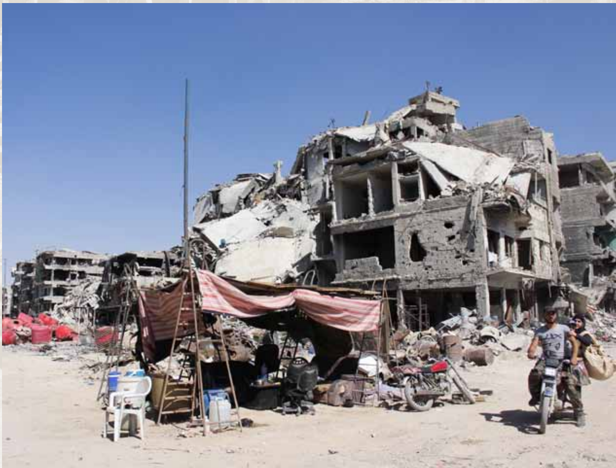
Yarmouk Refugee Camp, Syria, 24 June 2018.

The Syrian conflict has had a devastating impact on Palestinian refugees with approximately 120,000 being forced to flee Syria since 2011 and 4,027 killed (AGPS, 2019). Around 60 per cent of PRS (262,800) have been displaced at least once during the conflict and a vulnerability assessment carried out by UNRWA in 2018, found that 90 per cent of Palestinian refugee households in Syria live in absolute poverty (less than $2 per person per day) (UNRWA, 2019a). There are 12 Palestinian camps in Syria and, before the start of the Syrian war, there were approximately 560,000 registered refugees - though they were not all living in country. In the absence of a census, the number of refugees is monitored through the take-up of UNRWA services which include healthcare, education, vocational training, cash and food aid, water and sanitation. Three of the 12 camps are considered 'unofficial' as they are not administered by UNRWA but by the Syrian authorities. Three of the 12 camps that were home to 30 per cent of Syrian refugees - Yarmouk, Dera'a, and Ein el-Tal camps - were almost completely destroyed during the war and their populations have either been internally displaced or have fled abroad. 29,000 PRS have fled to Lebanon since 2011 (UNRWA, 2019f) and, by the middle of 2019, only