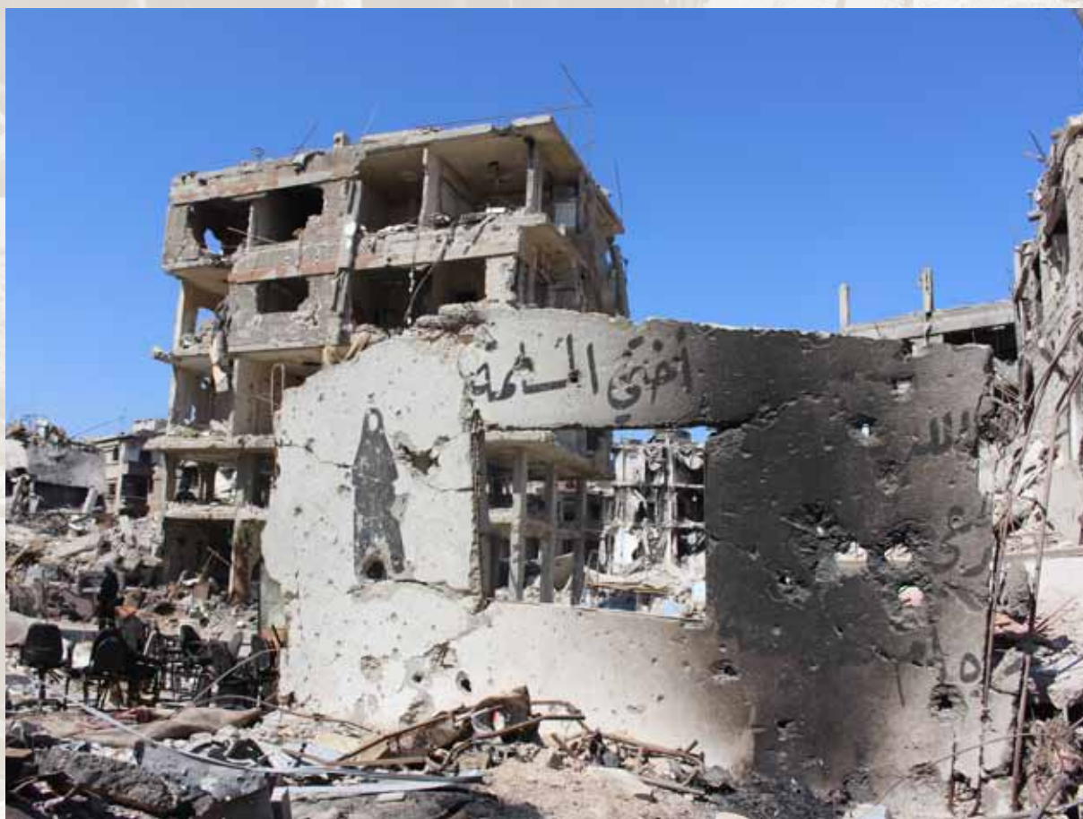
Yarmouk camp, Syria, 'reduced to rubble and uninhabitable' following six years of conflict and siege. 24 June 2018.

Before the conflict, Yarmouk was home to 160,000 refugees and the largest Palestinian camp in Syria. In 2012, fierce clashes erupted between the Palestinian Front for the Liberation of Palestine (PFLP), supported by Syrian government forces, and the Free Syrian Army. The intensity of the conflict displaced 140,000 refugees and the remaining 20,000 were trapped in a siege of the camp which denied the entry of vital food and medicine supplies. The fighting intensified when Islamic State (IS) ( Daesh ) invaded and took control of 60 per cent of the camp in 2015, which severed UNRWA's access to Yarmouk (UNRWA, 2015). The civilian population, already subjected to chronic hunger and shortages of medicines under siege, had to endure an air campaign from Syrian state forces which finally drove IS out of Yarmouk. Chris Gunness described Yarmouk at the time as a 'death camp' reduced to rubble and no longer habitable (Sanchez, 2018). The highest number of Palestinian casualties to date were in Yarmouk (1,422) (Ahroneim, 2019) with 263 killed in the Dara'a refugee camp, and 202 in the Khan El Sheikh refugee camp south of Damascus.