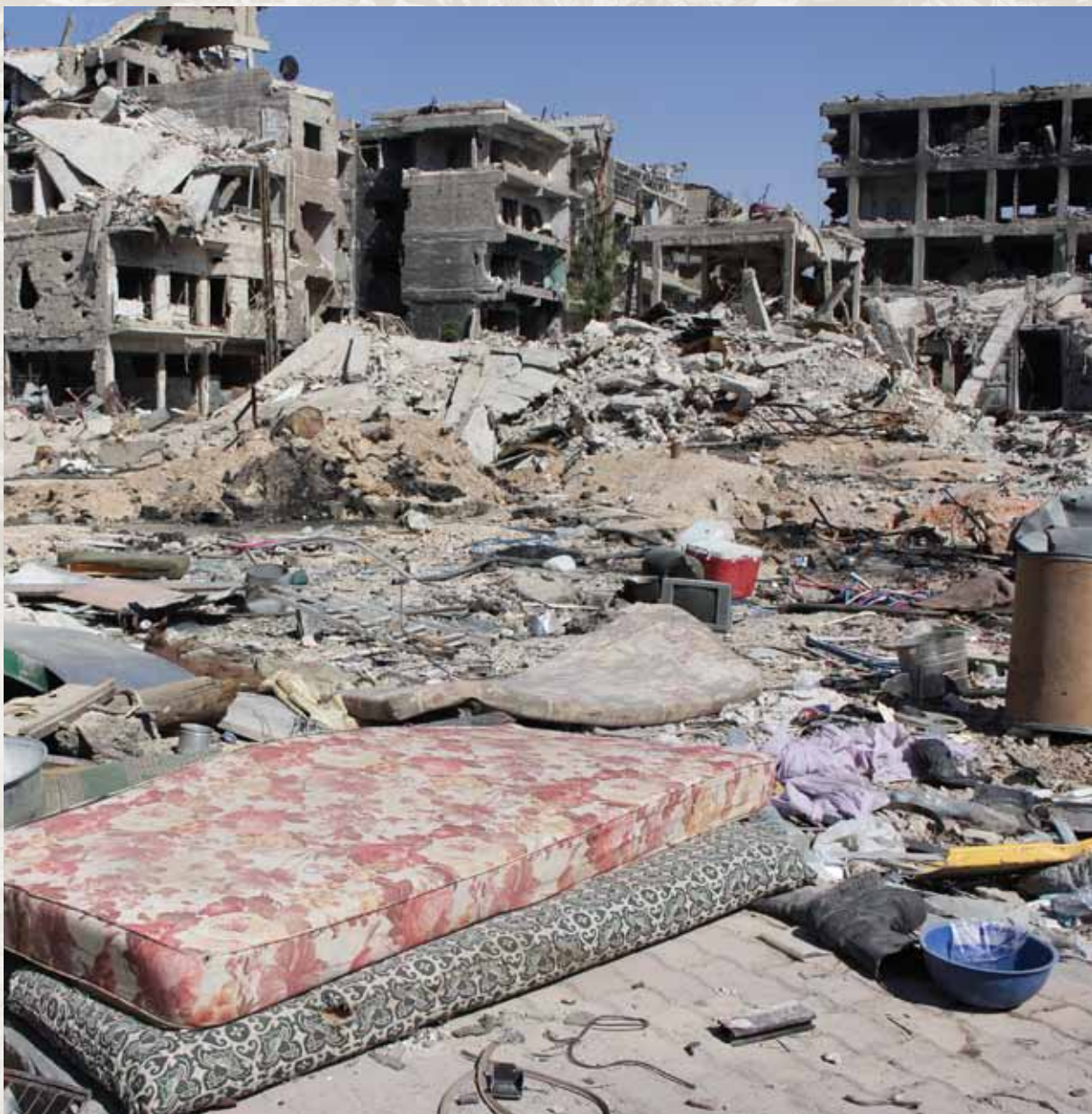
Yarmouk Refugee Camp, Syria, 24 June 2018.