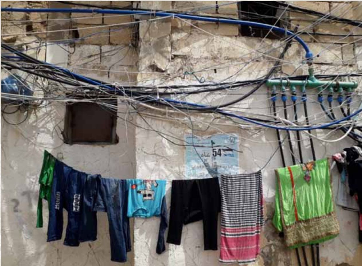
"A socially deprived environment". Burj Barajneh Refugee Camp, Beirut, Lebanon. 26 April 2019 (Stephen McCloskey, all rights reserved).

deteriorated water and sewage treatment systems, contaminated water, and jerry-rigged electrical wires' (Chaaban et al., 2016: 7). Unsurprisingly, these highly impoverished living conditions result in severe medical problems. The 2015 AUB survey found that 63 per cent of PRL and 75 per cent of PRS respondents reported at least one family member with 'an acute illness in the last six months' (Chaaban et al., 2016: 10). There are two additional problems that exacerbate the highly compromised living conditions in the camps. First, the land allocated to each camp has reportedly remained unchanged since 1948 which prohibits construction over a larger area as the population of the camps has increased. Second, Palestinian refugees are 'reported prevented from legally acquiring, transferring or inheriting real property in Lebanon' which severely limits their capacity to enhance their social and economic status (UNHCR, 2016: 7)