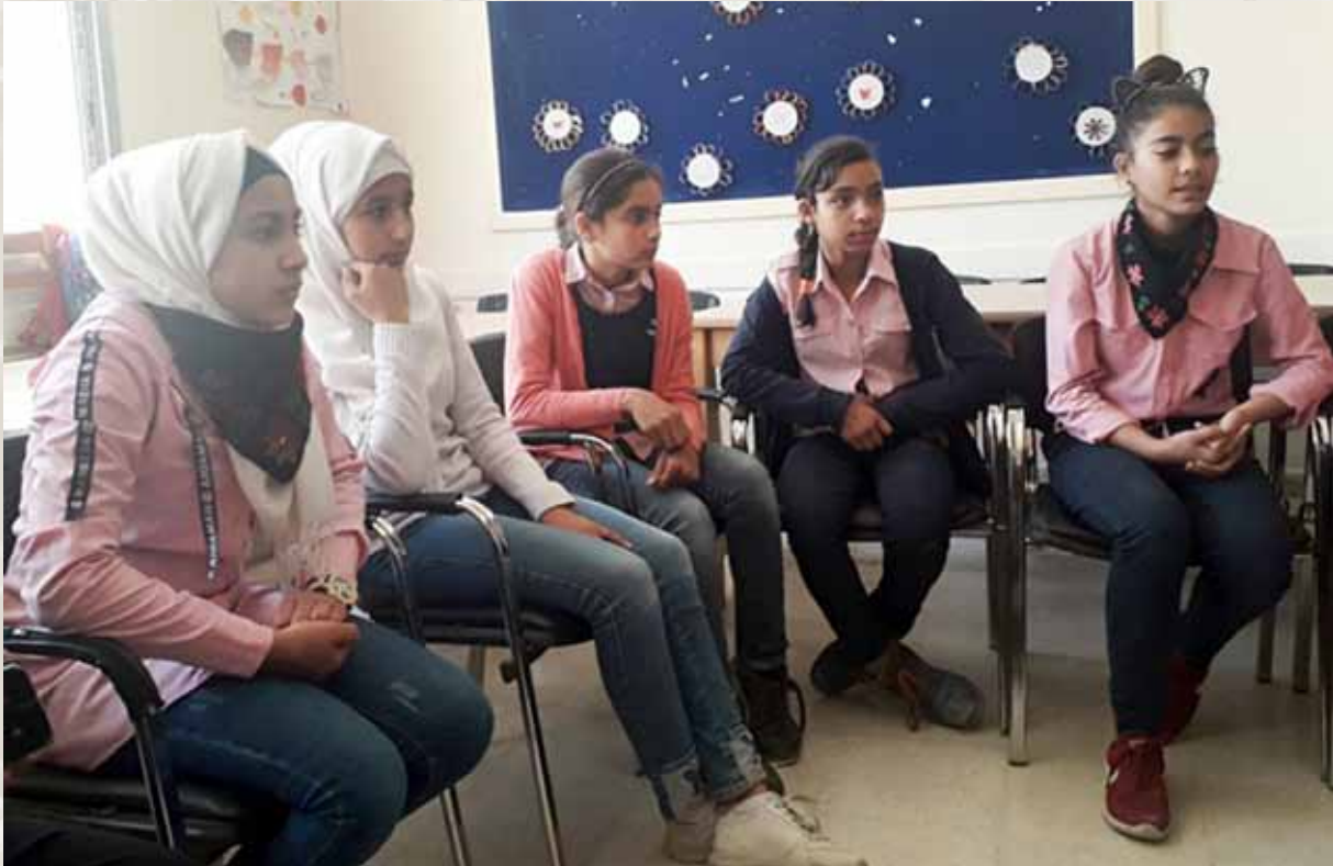
School Parliament, Sbeineh Refugee Camp, Syria, 29 April 2019.