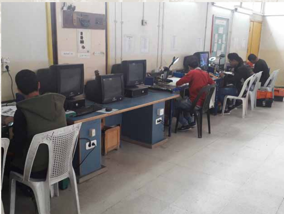
Post-primary students receiving training in an IT suite as part of the Vocational and Technical Training Programme offered by UNRWA in the Damascus Training Center (DTC), Syria, 29 April 2019.

In 2018, the Trump administration announced it was withdrawing all of its financial support from UNRWA, amounting to approximately one-third of the agency's $1.1bn annual budget (Beaumont and Holmes, 2018) which propelled it into what the agency's Commissioner-General described as an 'existential crisis' (UNRWA, 2019e). By the end of 2019, UNRWA reported that 95 per cent of PRS were in need of 'sustained