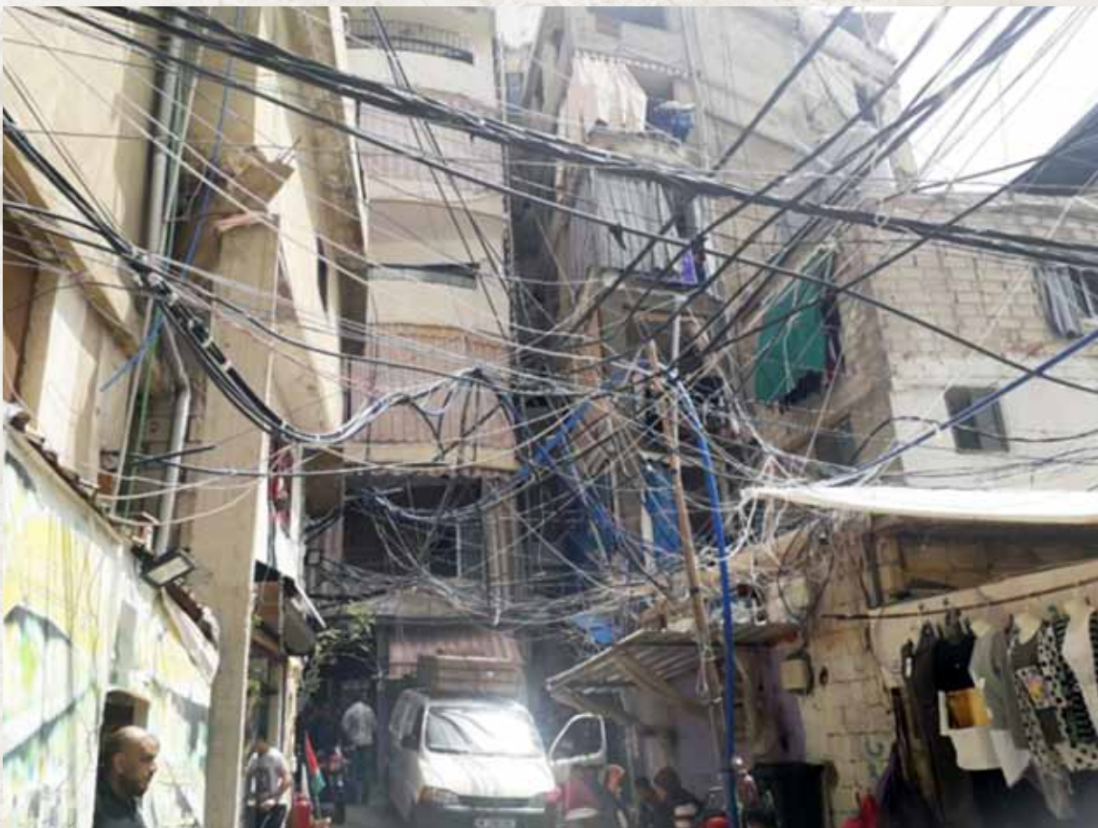
Shatilla Refugee Camp, Beirut, Lebanon. November 2018.

Before the outbreak of the Syrian conflict, Palestinian refugees in Syria enjoyed a status close to full citizenship which contrasted sharply with PRL, who have been perpetual outsiders in Lebanon despite their lengthy residency. The displacement of 60 per cent of PRS, over nearly ten years of war, has created a cascading effect of exacerbating the poverty levels of Palestinian refugees in Lebanon. The destruction of three Palestinian camps in Syria, particularly Yarmouk which was home to 160,000 PRS, forced 29,000 Palestinian refugees to flee to Lebanon, many of whom now reside in UNRWA camps. There has been a race to the bottom in living standards in Lebanon, as the entry of PRS to the informal labour market has reduced wages and increased competition for employment. The exclusion of PRL from 36 occupations in Lebanon and other discriminatory practices, that include denying Palestinians the right to own or transfer property, is preventing them from elevating their social and economic status. It is also demotivating young people's appetite for education if they are denied an opportunity to secure professional status in a contracted occupation. For many Palestinian refugees from Syria, education can be unavailable due to a lack of legal status or the need to take up employment to add to the family income. Educational drop-out rates for PRS are high and the numbers of PRS and PRL transferring from secondary to higher education remain low.