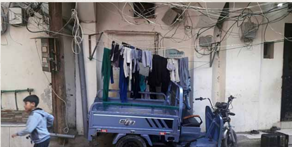
Burj Barajneh Refugee Camp, Beirut, Lebanon. 31 October 2019. Low hanging wires are a physical danger to camp residents, especially children.