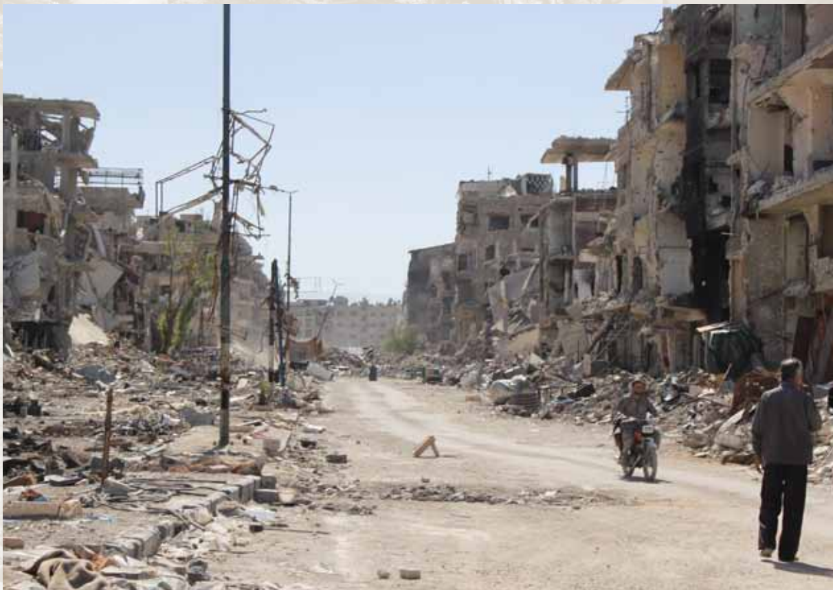
Yarmouk Refugee Camp, Syria, 24 June 2018. (Fidelma Bonass, all rights reserved).

Key words: Syrian conflict; Lebanon; Palestinian refugees; UNRWA; Economic Upheaval; COVID-19.