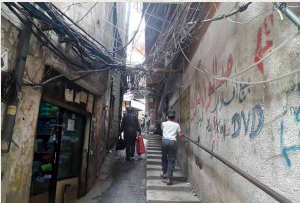
Burj Barajneh Refugee Camp, Beirut, Lebanon. 25 April 2019.

“The influx of Syrian and Palestine refugees from Syria into Lebanon are reported to have further compromised already limited living space, resources, services and job opportunities available to Palestine refugees in Lebanon and contributed to heightened community tensions” (2016: 3).