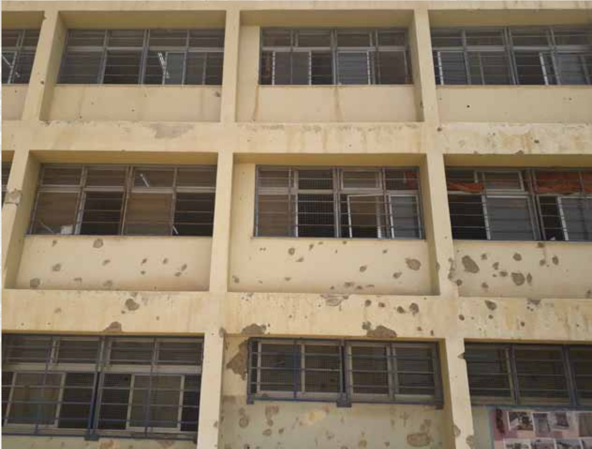
Shelled school building, Sbeineh Refugee Camp, Syria. 29 April 2019.

A 2019 UN Humanitarian Needs Overview (HNO) of Syria reported that 40 per cent of school infrastructure had been damaged or destroyed and that, between 2013 and 2018, there had been 367 attacks on schools and 355 attacks on hospitals and medical personnel (OCHA, 2019: 13-14). The UN statistics come with the health warning that ‘Verified data on humanitarian actors killed and injured is not available’ (OCHA, 2019: 12). This is one of the challenges of monitoring a conflict of such intensity and shifting frontlines.