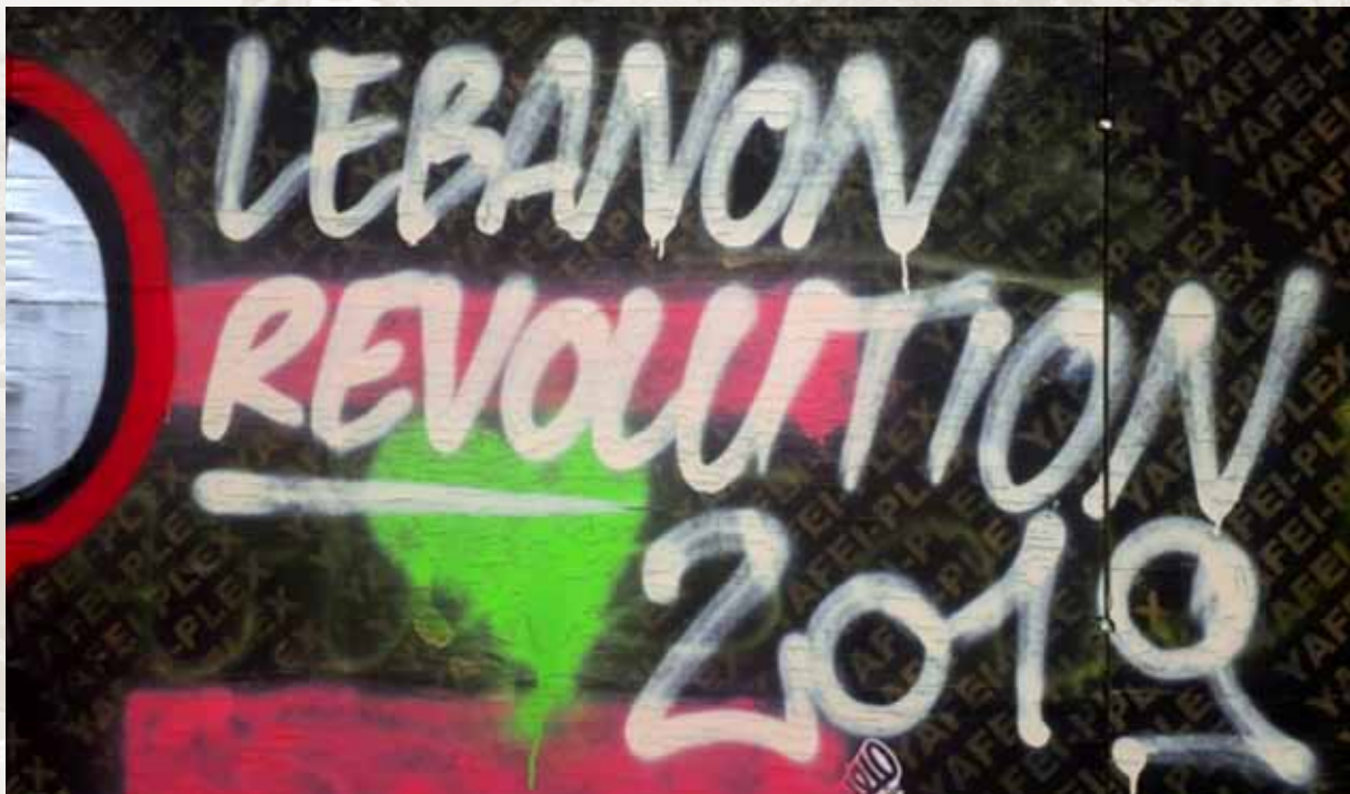
Graffiti in Martyrs’ Square, Beirut, Lebanon. 1 November 2019.

“My heart is loaded with hope seeing all these people demanding reforms, but I am not allowing any of my children to participate. We have to be prudent. We do not want the scenario of Palestinians in Syria to be repeated” (Ibid).