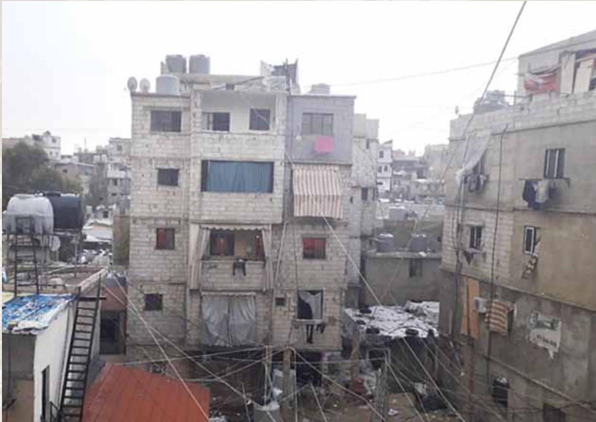
Shatila Refugee Camp, Beirut, Lebanon. November 2018. (Stephen McCloskey, all rights reserved).

One of the primary physical dangers to residents from the camp environment is an extensive network of criss-crossing electricity wires, which hang low between its narrow alleyways and intertwine with water pipes (Ibid: 10). There have been a total of 42 deaths from electrocution in Burj Barajneh over a two-year period (2016-18) with most of the victims being children (Ibid). These deaths can result from innocuously touching a wall where water and electricity wires collide. The camp, like many others, is a warren of narrow streets lacking any kind of meaningful sewage system, which means that they are regularly flooded during winter. Additional problems in the camp for some residents include food insecurity, chronic diseases caused by poverty, inadequate housing, sanitation, ventilation and a poor diet, and anaemia caused in some cases by lack of access to sunlight. The arrival of new refugees from Syria has enabled landlords to increase rents given the size of the market and rents on property vary depending on location and factors such as access to natural light (Ibid).