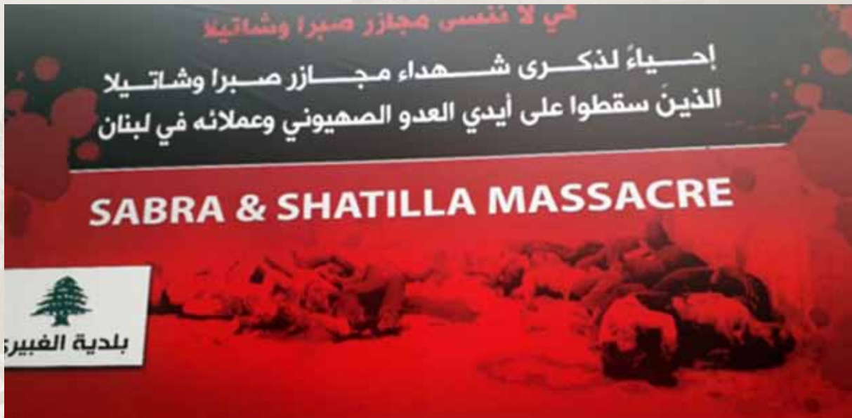
Memorial to the victims of the 1982 Sabra and Shatilla Massacre, Shatilla Refugee Camp, Beirut, Lebanon. 27 April 2019.