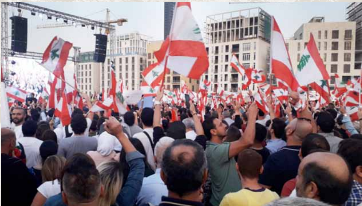
Anti-austerity protest in Beirut, Lebanon. 3 November 2019. (Stephen McCloskey, all rights reserved).

Lebanon hosts 950,000 Syrian refugees registered with UNHCR although the Lebanese government estimates the total number of in-country refugees from Syria at 1.5 million (UNHCR, 2019). Seventy-five per cent of Syrian refugees in Lebanon live below the poverty line compared to 27 per cent among the general Lebanese population, and their lives have become much harder over the past year following economic turmoil in Lebanon (Kranz, 2020). The devaluation of the Lebanese pound from 1,500 to one US dollar to 2,000 to the dollar has inflated prices and sparked a wave of anti-austerity protests since October 2019 (Ibid; Ensor and Haboush, 2019). Lebanon has a national debt of nearly $90 billion, which is equivalent to 170 per cent of its Gross Domestic Product (GDP) with around 50 per cent of government revenues set aside for payment of interest on the debt (Cornish and Stubbington, 2020; The Guardian , 2020).