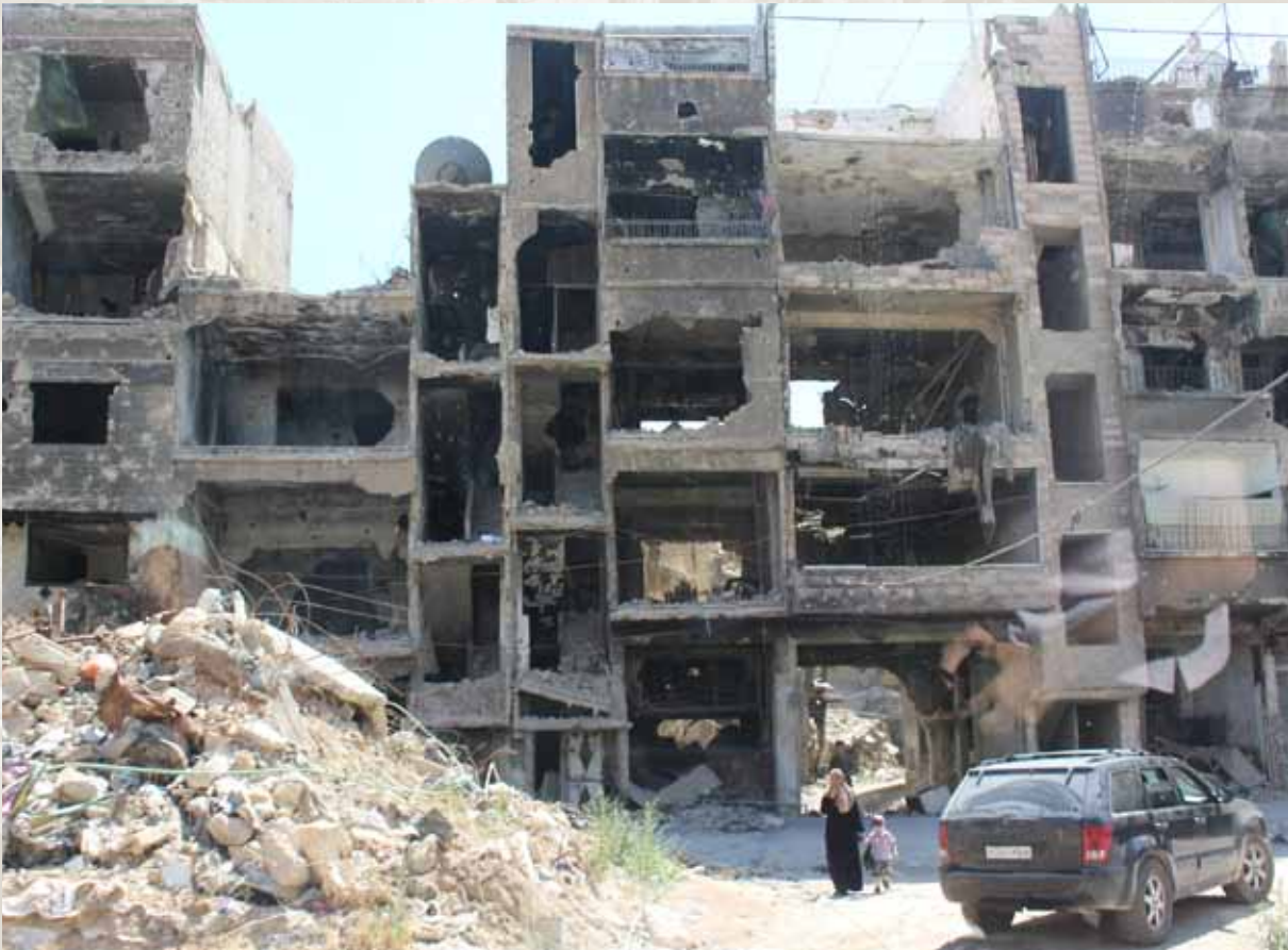
Yarmouk Refugee Camp, Syria, 24 June 2018.

At the time of writing, more than 780,000 people have been infected by the COVID-19 virus in more than 170 countries with 37,800 deaths confirmed globally (Boseley, Devlin and Belam, 2020). As a respiratory virus passed from an infected person by coughs, sneezes or droplets of saliva, the advice from governments has been to ensure 'social distancing' by staying two metres away from other people when outdoors. But for Palestinian refugees living in close proximity in densely populated camps in Lebanon and Syria, the likelihood of the spread of infection is high with an obvious difficulty in self-isolating. Lebanon's financial crisis has impacted on its health service with a shortage of drugs and medical supplies, and just one hospital is being used to treat and quarantine COVID patients (Khatib, 2020). Palestinians are fearful that a surge in COVID cases could result in patients being forced to pay for testing or hospitalisation; costs which are beyond them. With Lebanon, like many other nations, in COVID lockdown, Palestinians employed in the informal economy dependent on daily payments, may find themselves without any regular income.