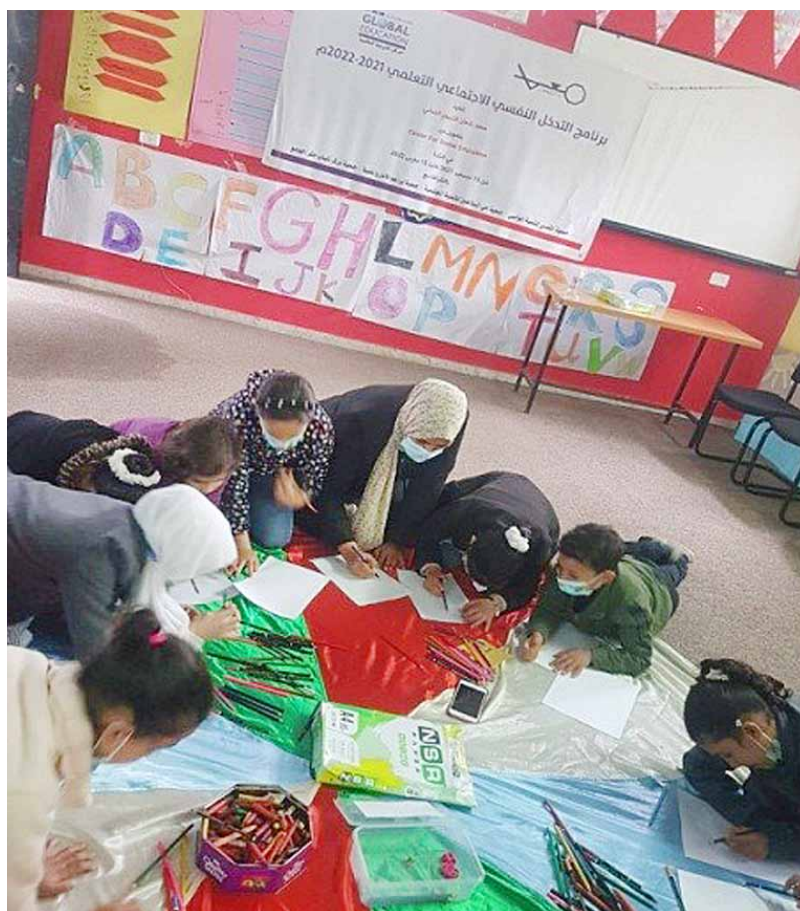
Psycho-social support workshop using arts and crafts. Canaan Institute, 2022.

The project had four main aims. The first was to provide psychosocial support to 400 children aged 7-12 years suffering from the acute effects of trauma caused by four wars in the Gaza Strip since 2008 and the grinding poverty created by a fifteen-year Israeli siege. The second aim was to supplement the children's education by providing community-based learning focused on core areas of the school curriculum such as Literacy, Numeracy and Science. The third aim was to deliver workshops to the children's parents with a view to extending psychosocial care into the household. The fourth aim was to build the capacity and skills of staff in the four partner organisations in Gaza that hosted and delivered the training. The project was delivered in four