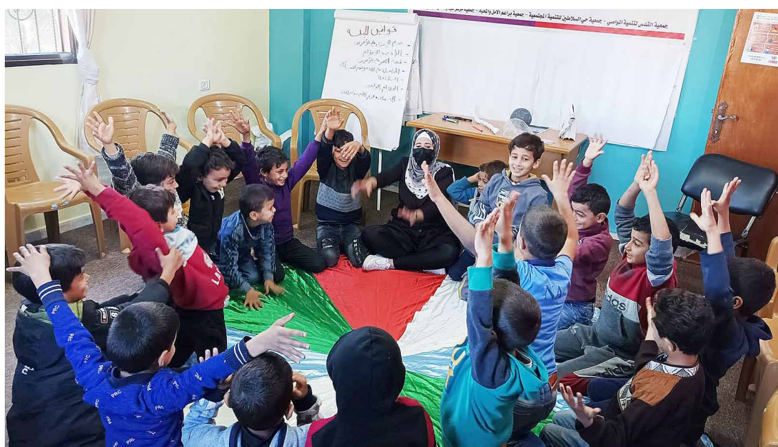
Psychosocial support workshop. Canaan Institute, 2022.

The 400 children enrolled on to the project were selected by the four community centres in consultation with surrounding schools and visiting psychotherapists working with children in each school. The project enrolled children manifesting the most acute forms of trauma and anxiety who were identified by teachers and psychotherapists. A key component of the project was its 'joined-up' approach to the children's therapy by involving their families, schools and the local community. This ensured that the education activities targeted areas of the school curriculum in which the children needed support as well as providing psychosocial therapy to address the causes of stress. The four community organisations involved in project delivery were: