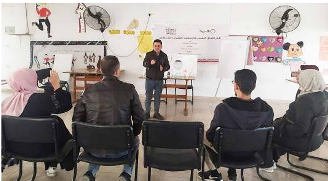
Facilitator training led by the Canaan Institute as part of stage 1 of the project in January 2022.

The project was launched and contracts signed by the Canaan Institute and the four community organisations on 16 January. Three members of staff from each of the four community centres received