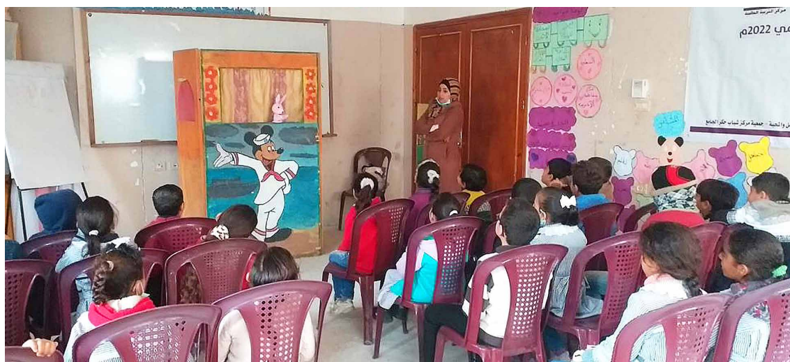
A facilitator leads a workshop with children using puppet theatre as part of the 2022 project in Gaza.

The twelve facilitators also attended an end-of-project evaluation day organised by the staff of the Canaan Institute. This was a day of reflection on the project outcomes and the methodologies and materials used in the project activities. A major strength of the programme is the provision of lifelong learning skills to facilitators which will strengthen their professional development.