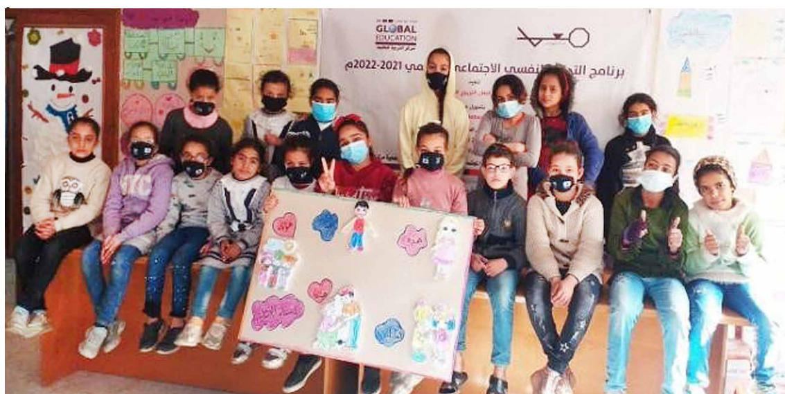
Arts and crafts session. Canaan Institute, 2022.