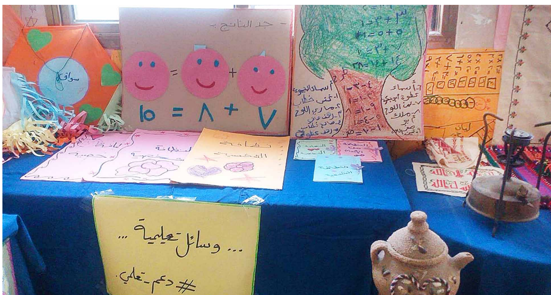
Arts and crafts produced by the children as part of the 2022 project.

The performances were attended by the children's families, local community members, the staff of Canaan Institute and the board of directors of each community association participating in the programme.