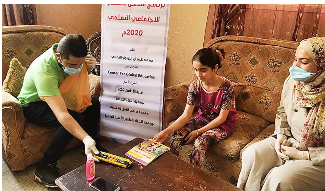
A home visit in Gaza during the COVID-19 pandemic in 2020 as part of the Centre for Global Education / Canaan Institute project.

The vulnerabilities of Gaza's mostly refugee population have been preyed upon by the COVID-19 pandemic both in terms of its impact on an already overwhelmed health service and downward pressure on the economy and incomes. Medical Aid for Palestinians has reported 248,631 COVID-19 cases and 1,964 deaths in Gaza with pandemic mobility restrictions impacting access to healthcare and emergency nutrition services. 53 per cent of households experienced a drop in their monthly income as a result of COVID-19 with 51 per cent of workers in Gaza employed in the informal economy which made them more vulnerable to temporary or permanent redundancy during the pandemic.