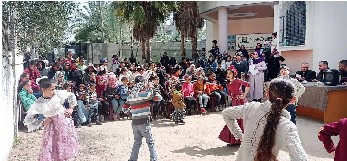
Children dancing at a Celebration Day at the end of the project in May 2022. Canaan Institute, 2022.

family members to see the work carried out by the children in Art & Design, Mathematics, Health & Science, English and Arabic reflecting the high quality activities delivered by the facilitators.