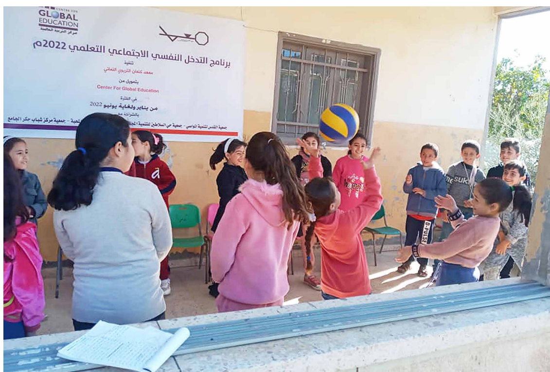
A group sport activity as part of the project in 2022. Canaan Institute, 2022.