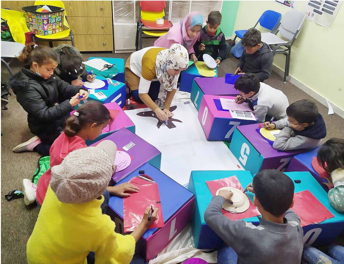
An arts and crafts workshop. Gaza, 2022. Canaan Institute.