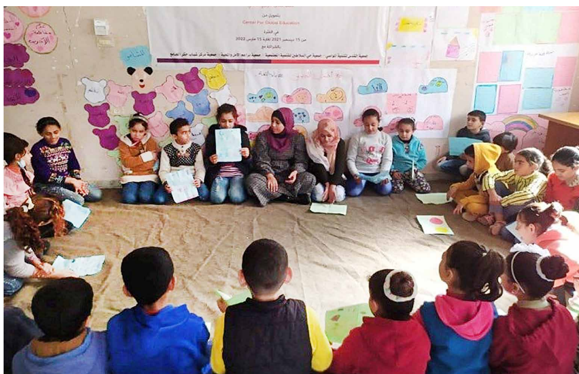
A facilitator leads children in a group learning activity. Canaan Institute, 2022.

On 6 February 2022, the training began with 100 children enrolled in each centre facilitated by three staff members. The children in each centre were divided into groups of 25 along age lines. Two groups of 25 attended classes on Saturday, Monday and Wednesday and the other two groups on Sunday, Tuesday and Thursday; Friday was a rest day. This meant that 100 children in each centre attended 12 workshops every month with six of the sessions focused on formal sector learning and six sessions on psychosocial support. Facilitators worked with each group over two periods each day from 9.00am to 11.00am in the morning and 12.00 - 2.00pm in the afternoon. In total, 576 sessions were organised across all four centres over the duration of the project. 288 sessions focused on formal sector learning and 288 focused on psychosocial support activities using structured play, art, theatre, role play and other expressive mediums.