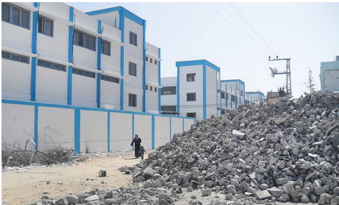
Zeitoun Preparatory Schools for Girls, an UNRWA school located in a southern district of Gaza City, opposite a government building destroyed in 2012's Operation 'Pillar of Defense', one of four Israeli military offensives on Gaza since 2008.