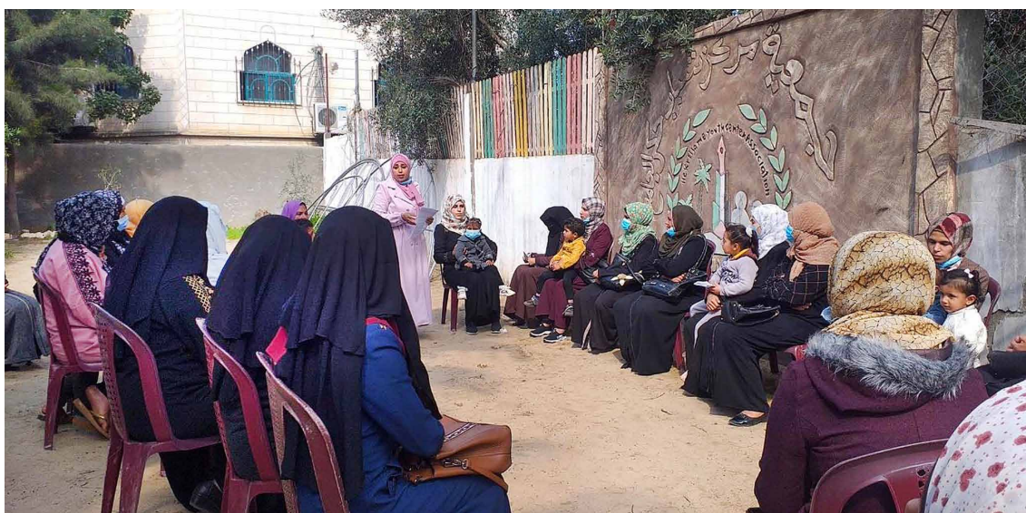
Parents attending a family workshop aimed at strengthening psychosocial support for children in the household. Canaan Institute, 2022.

The facilitators consulted with parents on a one-to-one basis to help them monitor the progress of their child and identify areas of learning in which they needed specific support. Many parents struggle to manage children subject to stress and trauma and so the assistance provided by the community centres and schools is invaluable.