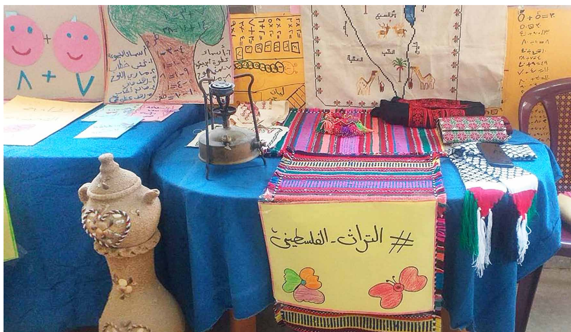
Arts and crafts produced through the project. Canaan Institute, 2022.